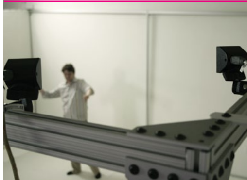
BioStage is a complete motion capture solution that considerably improves the process of 3D human motion analysis.