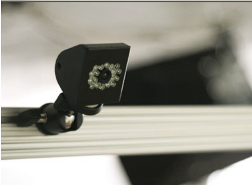
High speed Organic Motion cameras act as the eyes of this groundbreaking computer vision system.